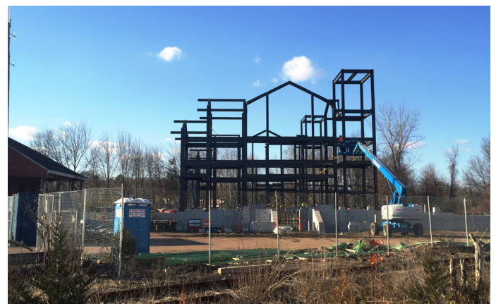
Construction of the new Berlin Station

Responses to the RFQ were received in spring 2015 and qualified firms were short listed in summer 2015. It is expected that the RFP will be issued to the short listed firms during spring 2016. Final selection of a service provider is scheduled to occur in late 2016.